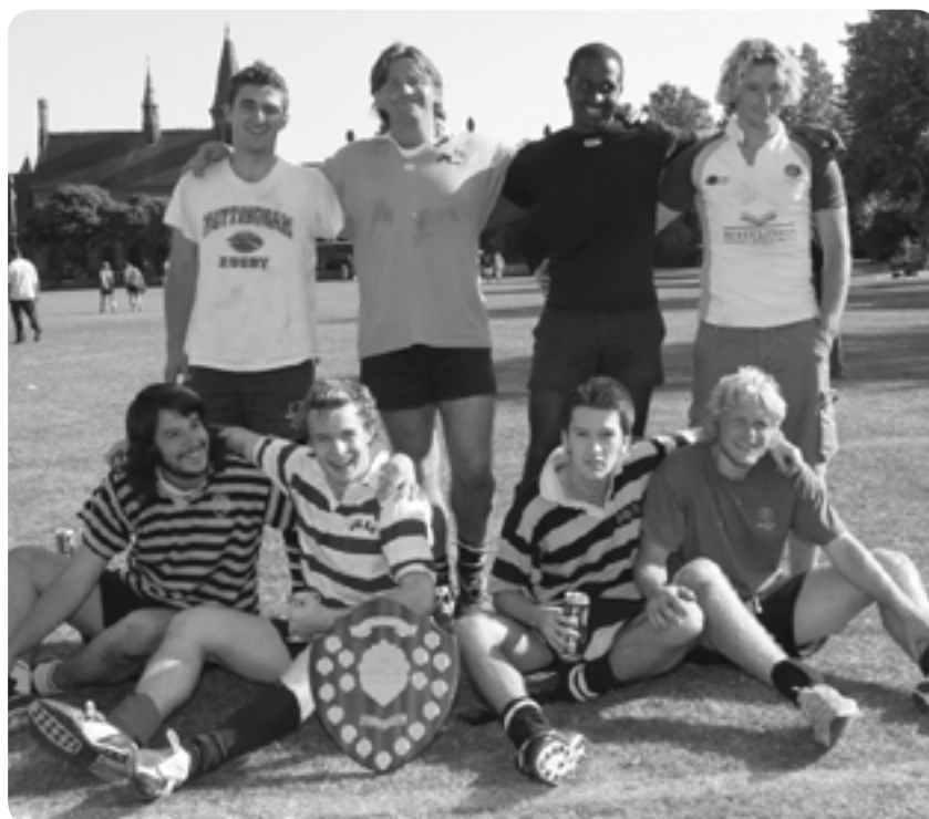
Team X-treme, winners of the Goss & Co Shield