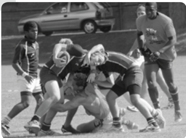
No holds barred!