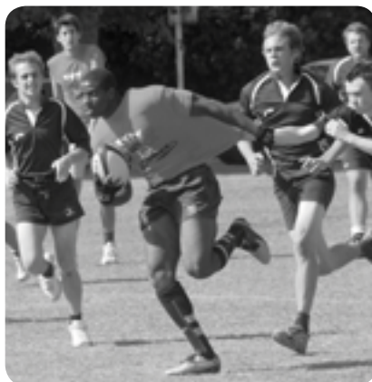
Running man breaches defence