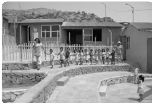
Children and nurses at the pre-school run by the BCT and the Hand in Hand Trust in Zapallal, one of the poor shanty towns on the outskirts of Lima.