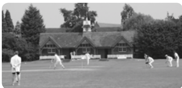
The newly refurbished Keeton Pavilion

1986 saw the quincentenary of the re-founding of the School, a year marked by a visit of H.M. the Queen, many happy social events, and the practical measure of a Quincentenary Fund Appeal, to achieve a number of objectives including the modernisation of the pavilion.